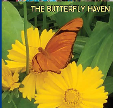
THE BUTTERFLY HAVEN