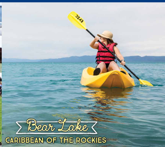
Bear Lake CARIBBEAN OF THE ROCKIES