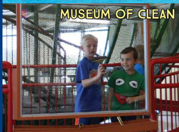
MUSEUM OF CLEAN