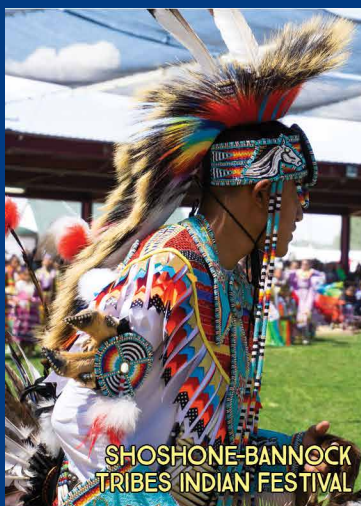
SHOSHONE-BANNOCK TRIBES INDIAN FESTIVAL