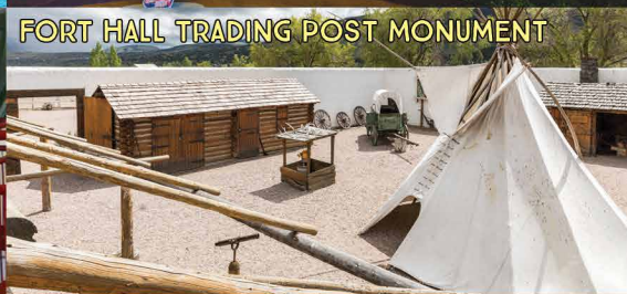
FORT HALL TRADING POST MONUMENT