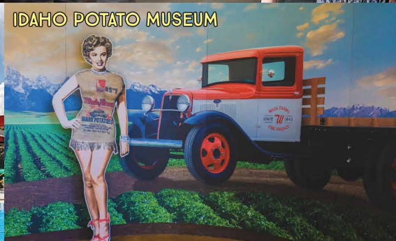
IDAHO POTATO MUSEUM