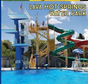
LAVA HOT SPRINGS WATER PARK