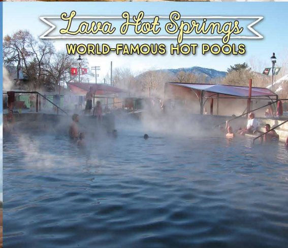
Lava Hot Springs WORLD-FAMOUS HOT POOLS