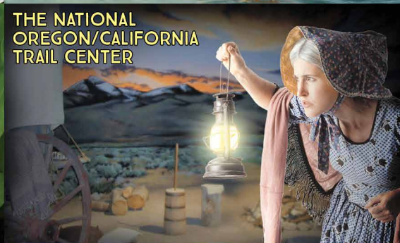
THE NATIONAL OREGON/CALIFORNIA TRAIL CENTER