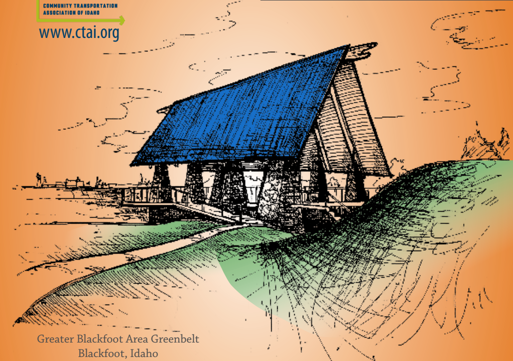
Greater Blackfoot Area Greenbelt Blackfoot, Idaho