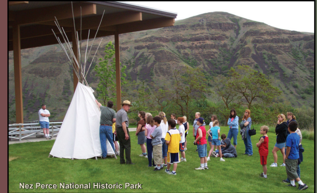
Nez Perce National Historic Park