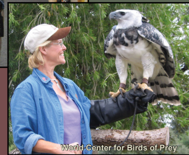
World Center for Birds of Prey