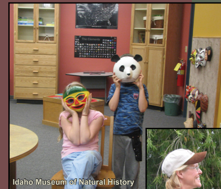
Idaho Museum of Natural History

History • Science • Natural History • Fine Arts Parks • Zoos • Nature Centers